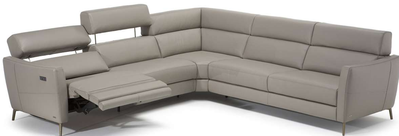
■ Vers. F50+F38+011+019