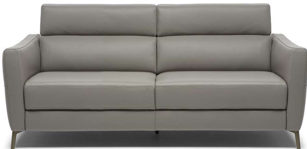
■ Vers. 009